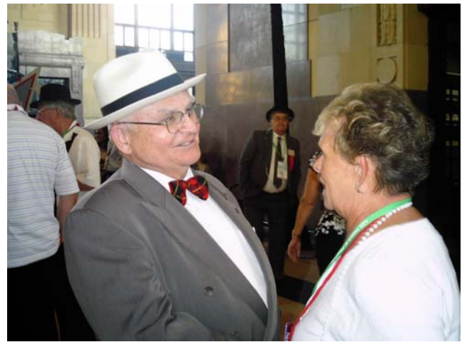
The Honorable Harry S Truman, former President of the United States, welcomes the widow of Wendell Wilke to Kansas City.