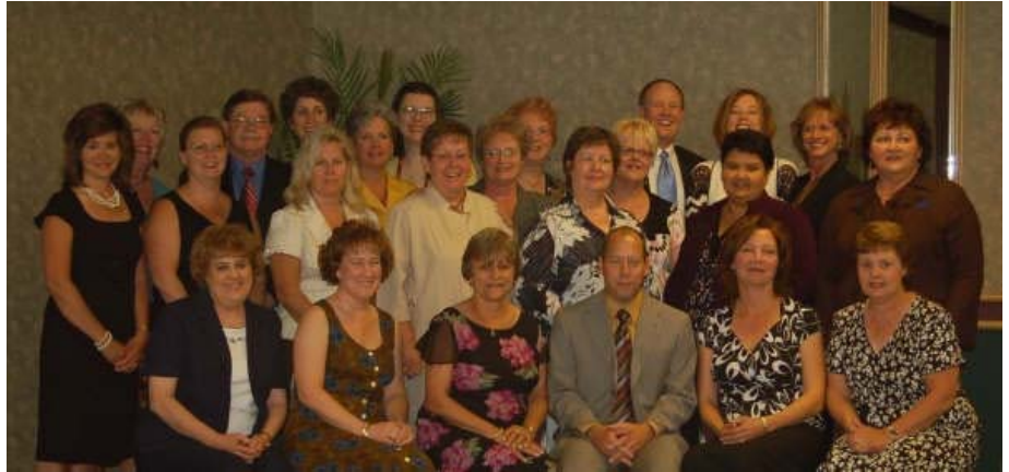
Washington State Association of County Clerks 102 nd Annual Conference, Clarkston, Washington June 26, 2008