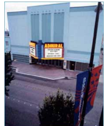
Admiral Theater then and now

To register go to http://wacounties.org/wsac/wsac_conference.asp . We look forward to seeing you in Bremerton!