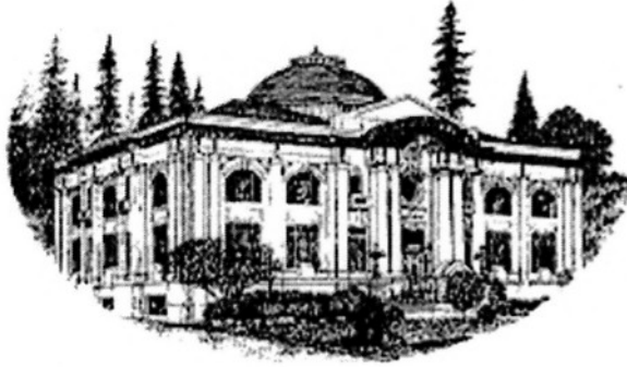
PACIFIC COUNTY COURTHOUSE National Historic Site