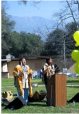
Hahamongna Watershed Park: CA. RTCA is assisting the City of Pasadena with community-based planning for a 30-acre addition to this park. Leaders of the Gabrieleno/Tongva Band of Mission Indians of San Gabriel participated in an open house event.