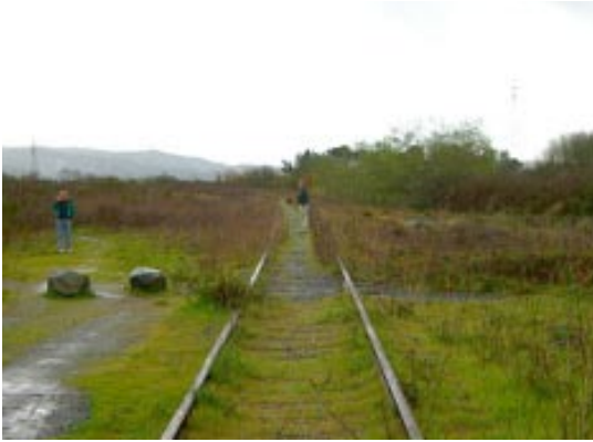
Humboldt Bay Trail, Eureka to Arcata, CA. Humboldt Bay, rich in ecological and recreational resources is the natural, cultural, and political center of California's north coast. RTCA is working with a multi-agency planning team to assess and define directions for a proposed 7-mile Humboldt Bay rail-with-trail for bicyclists, hikers, and other recreational users.