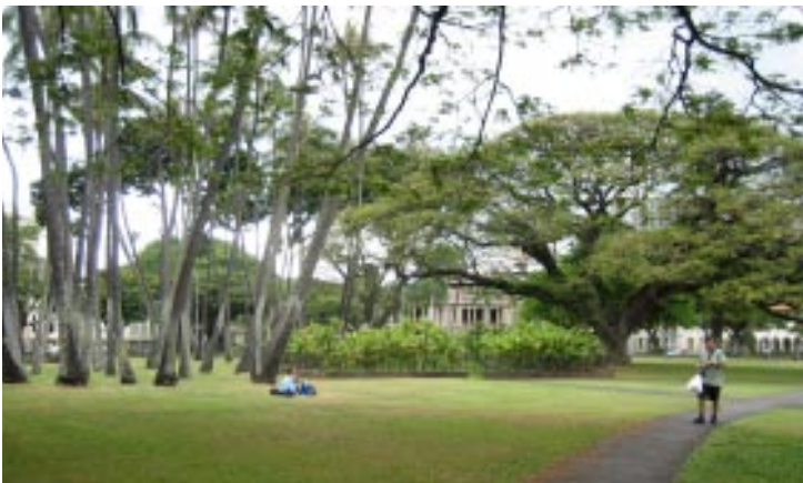
Hawai'i Capital Cultural District Open Space, HI: Once the capital of the Hawaiian Kingdom, this Honolulu district houses the state capitol and many museums, historic sites and open spaces. A public-private coalition is working to enliven the district, encourage pedestrian use and highlight cultural and historic assets. RTCA is helping develop a master plan including five miles of designated routes and enhancements linking 188 acres of urban parks to cultural destinations such as the 'Iolani Palace, shown above.