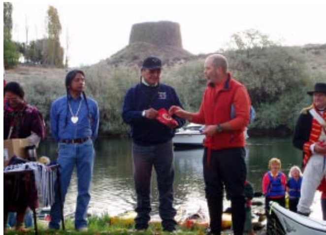
Northwest Discovery Water Trail: ID, WA, OR. A year-long celebration of dedication events is launching the Northwest Discovery Water Trail, a 367-mile water route through three states. Here, at Hat Rock State Park, The Confederated Tribes of the Umatilla Indian Reservation present peace medals to the Water Trail Steering Committee at a "Trace the Trail" Lewis & Clark Bicentennial event. RTCA is helping with public outreach and development of a trail management plan.

A network of 70 community-based planning professionals delivers the RTCA Program nationwide, helping communities to help themselves achieve on-the-ground success. Through RTCA, the National Park Service offers conservation assistance to communities in every state.