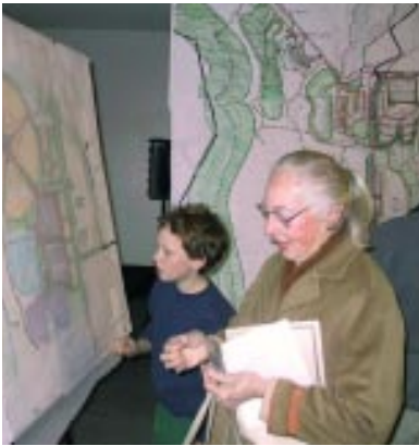
Northern State Recreation Area: WA. RTCA partnered with Skagit County and the ASLA's state chapter to provide a two-day charrette (design workshop) to create a Master Plan for transforming 700 acres of fallow farmland and wetlands into the largest county-owned recreation site in the region. Community members were invited to provide feedback at an open house.