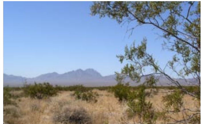
Searchlight Trails: Searchlight, NV. Through a series of community trail mapping workshops and field classrooms, the Searchlight Trails Task Force is developing approximately 10 miles of multi-use trails that will connect significant area destinations including Lake Mead National Recreational Area. RTCA is assisting community members with the development of the Task Force.