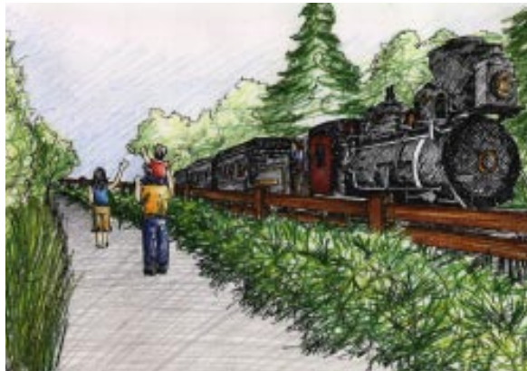
Upper Nisqually Trail: WA. RTCA helped Pierce County and local citizens develop a vision for the Upper Nisqually Trail, an 8-mile multi-use trail connecting Elbe and Ashford, two gateway communities of Mt. Rainier National Park. The new trail is envisioned to follow a railroad right-of-way with 3-miles designed as a 'Rail-with-Trail' located adjacent to an active rail line. Artist: Audrey Stout.